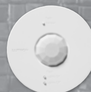
Radio Powr Savr™ wireless occupancy/vacancy sensor